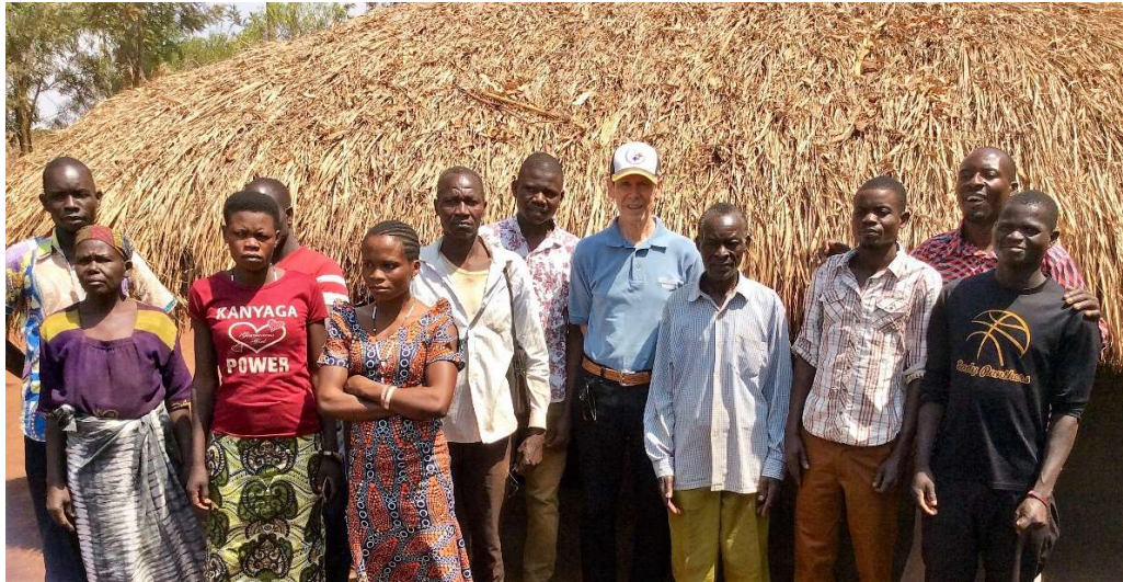
With congregational leaders in front of their rented church building in Hanga