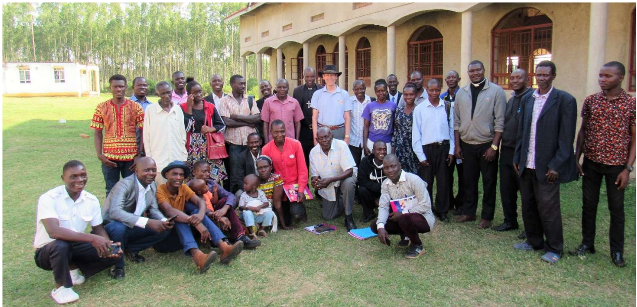
With attendees of the Renewal Conference at the Lutheran Theological College