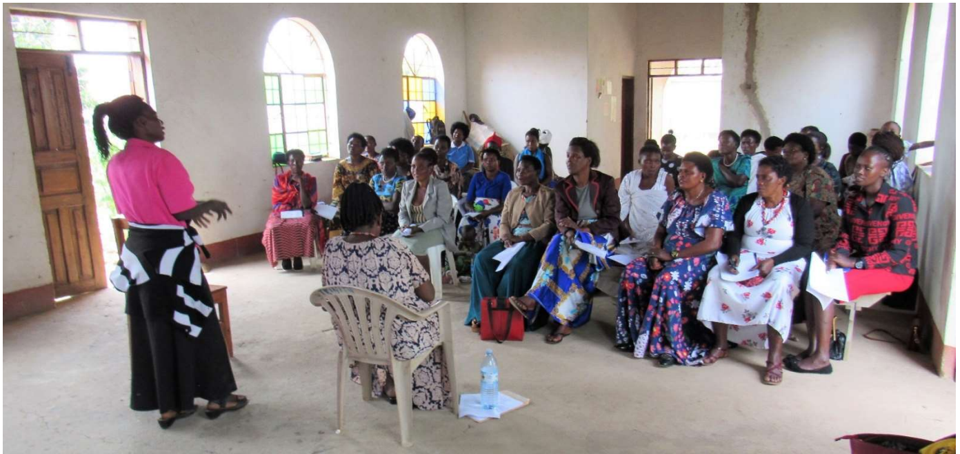
Women's Session at the Renewal Conference