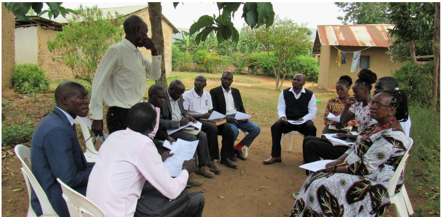
Small group discussion during the Renewal Conference at Holy Trinity Lutheran Church