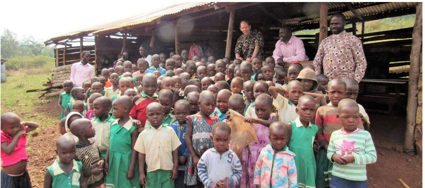
With the children of St. Peter's Lutheran Nursery and Primary School, Kyamujwara