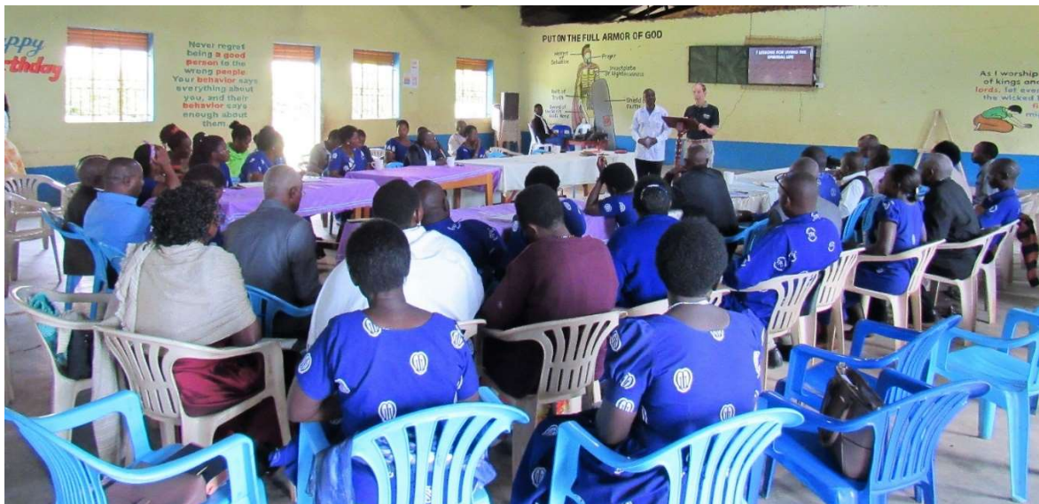
Wednesday retreat for Mothers and Fathers Union leaders