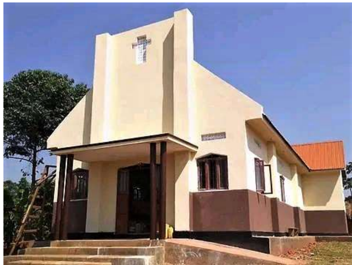
The new Kyabazaala Lutheran Church