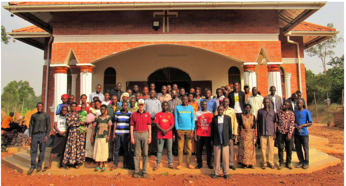
With attendees of the Renewal Conference at Masindi Lutheran Church