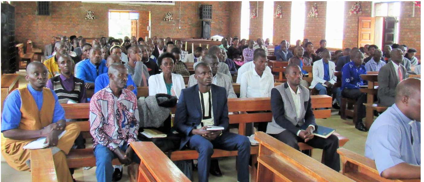
Tuesday retreat for Lay Readers at St. Paul's Cathedral