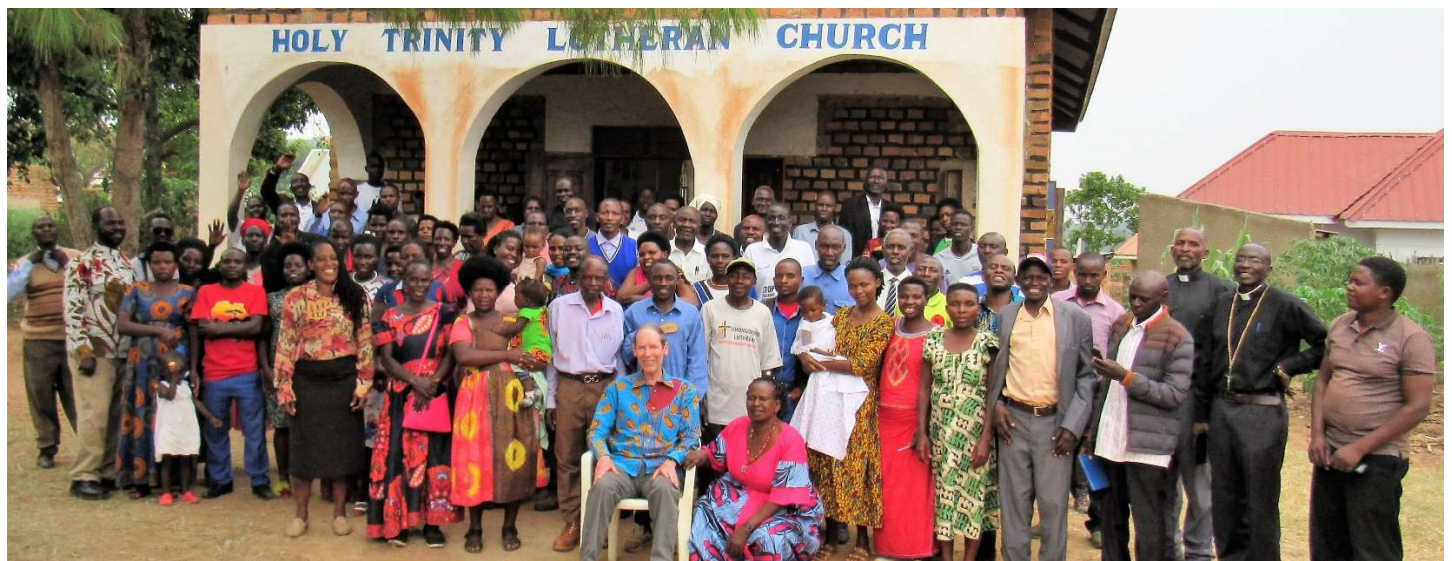
With attendees on Friday at the end of the conference