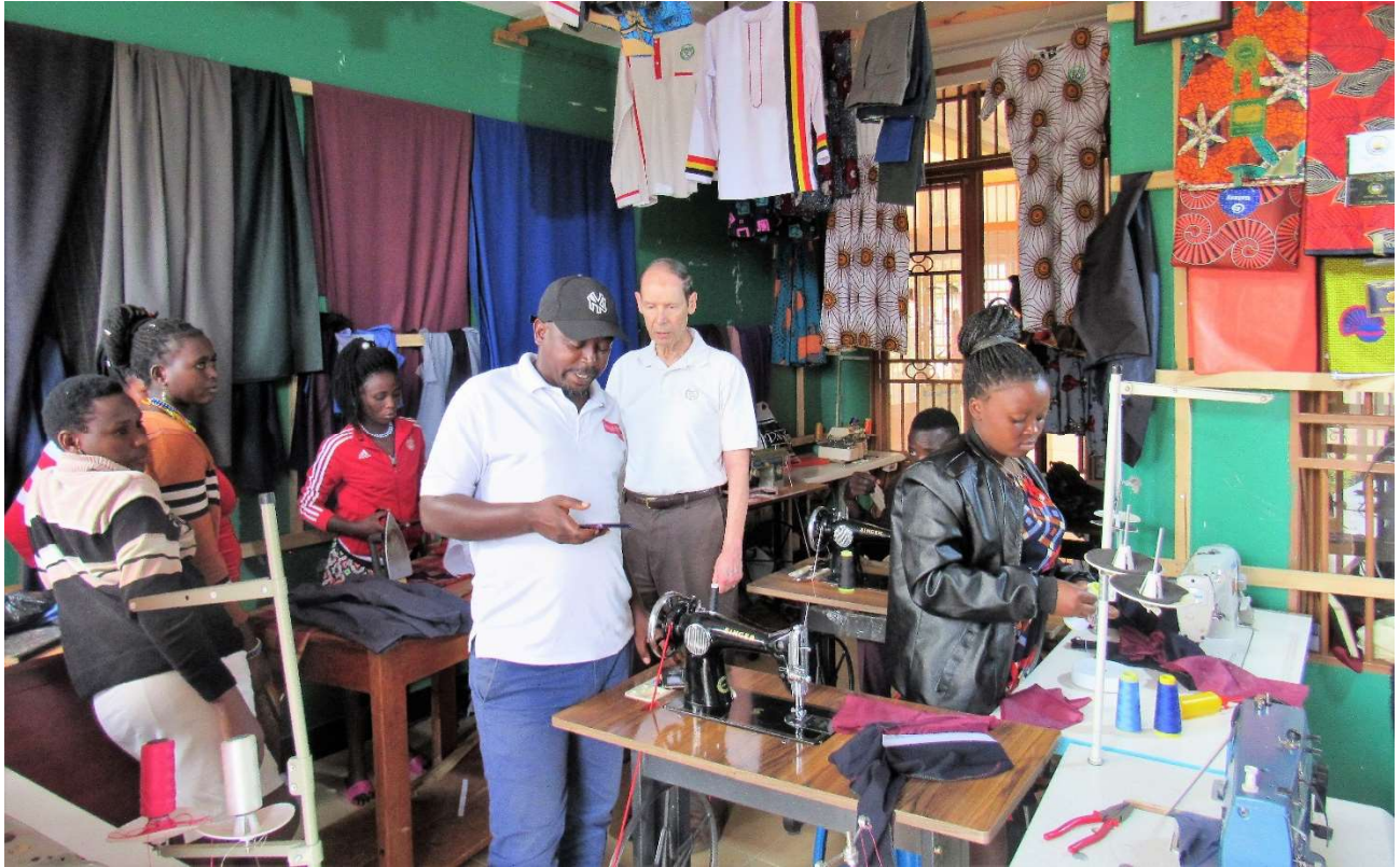
Touring the Marianne Foundation's clothing shop