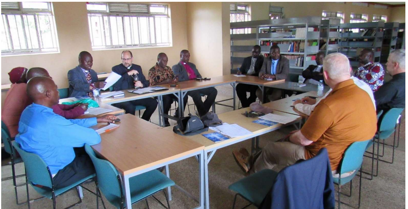
Meeting with the board of the seminary