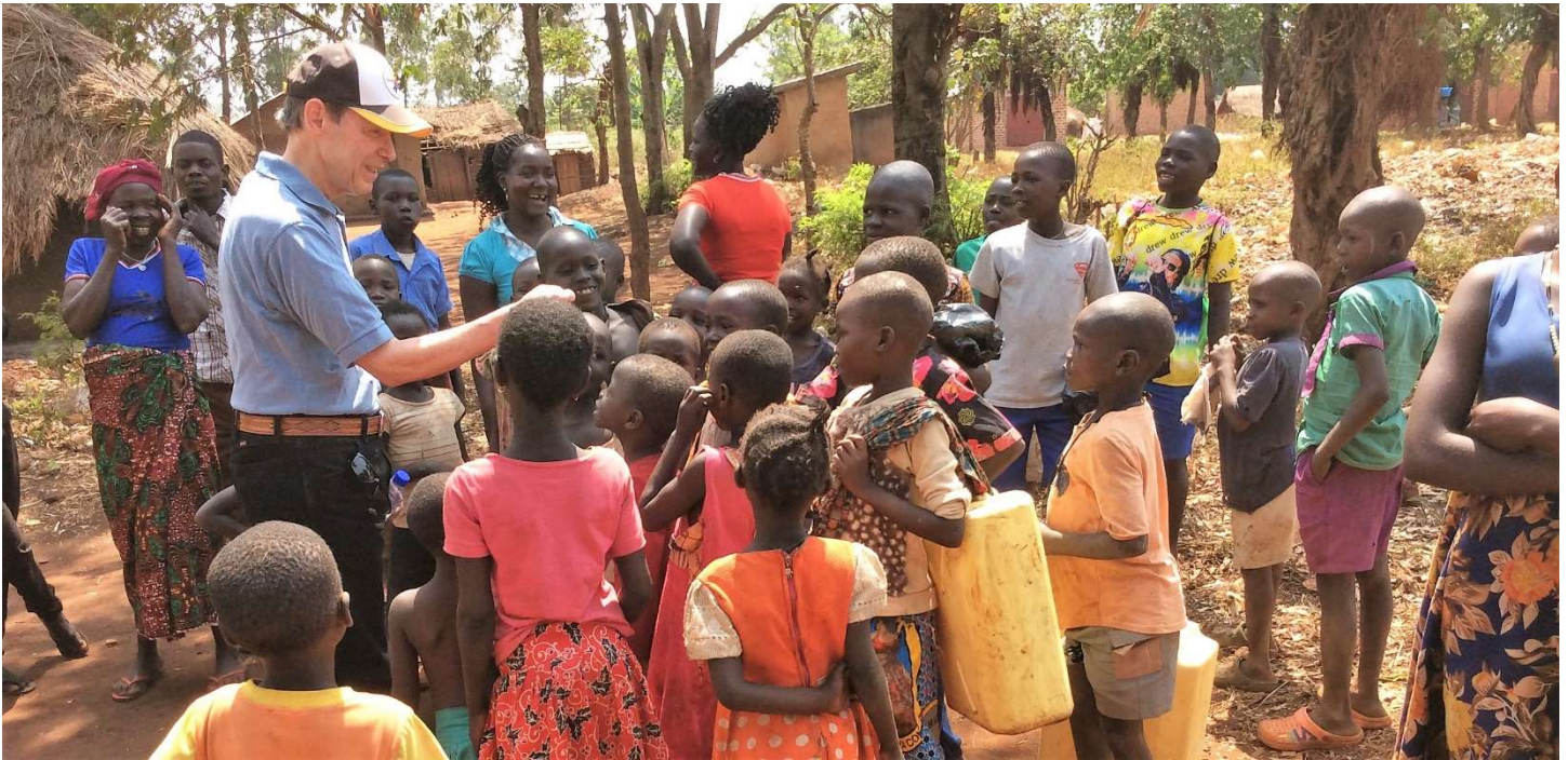
Fist bumping the children before we leave