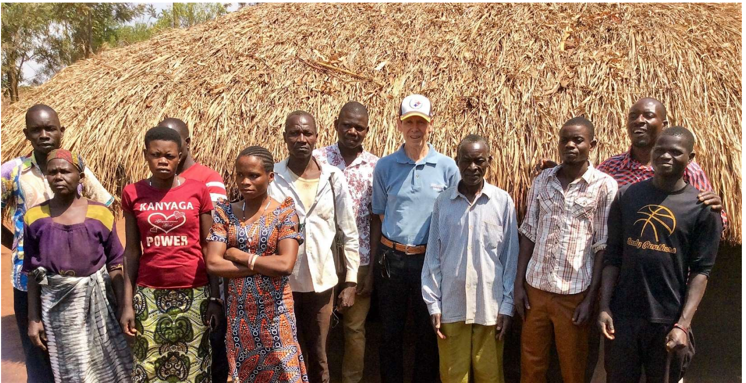
With congregational leaders in front of the church they are renting

This congregation is currently worshipping in a rented building that is owned by the government; however, there is a one-acre lot for sale nearby for only $1,700 and the LCU would like to purchase the lot for this congregation. Unfortunately, the deanery lacks the funds to make the purchase. Once they can raise the funds and purchase the lot, the men of the church can build a temporary structure for a school and Sunday worship. Of course, the school also would need a bore hole for water. I should mention that currently the children do not have a school to attend, which is why they all gathered around when we arrived.