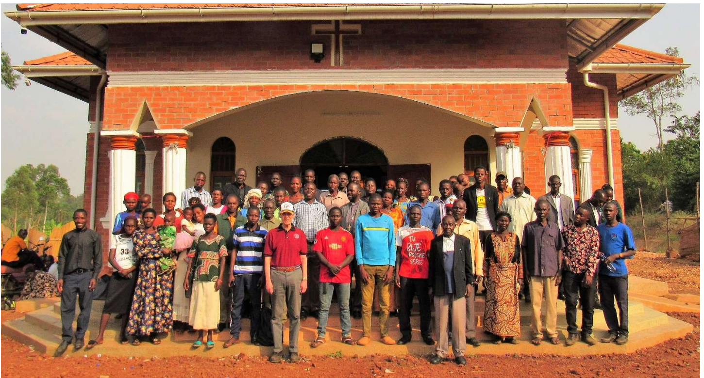
Group photo at the end of the 3-day Renewal Conference

After returning to Masindi on Friday, I led a retreat on 7 Lessons for Living the Spiritual Life and after each lesson we had time for people to share their testimonies on that particular topic.