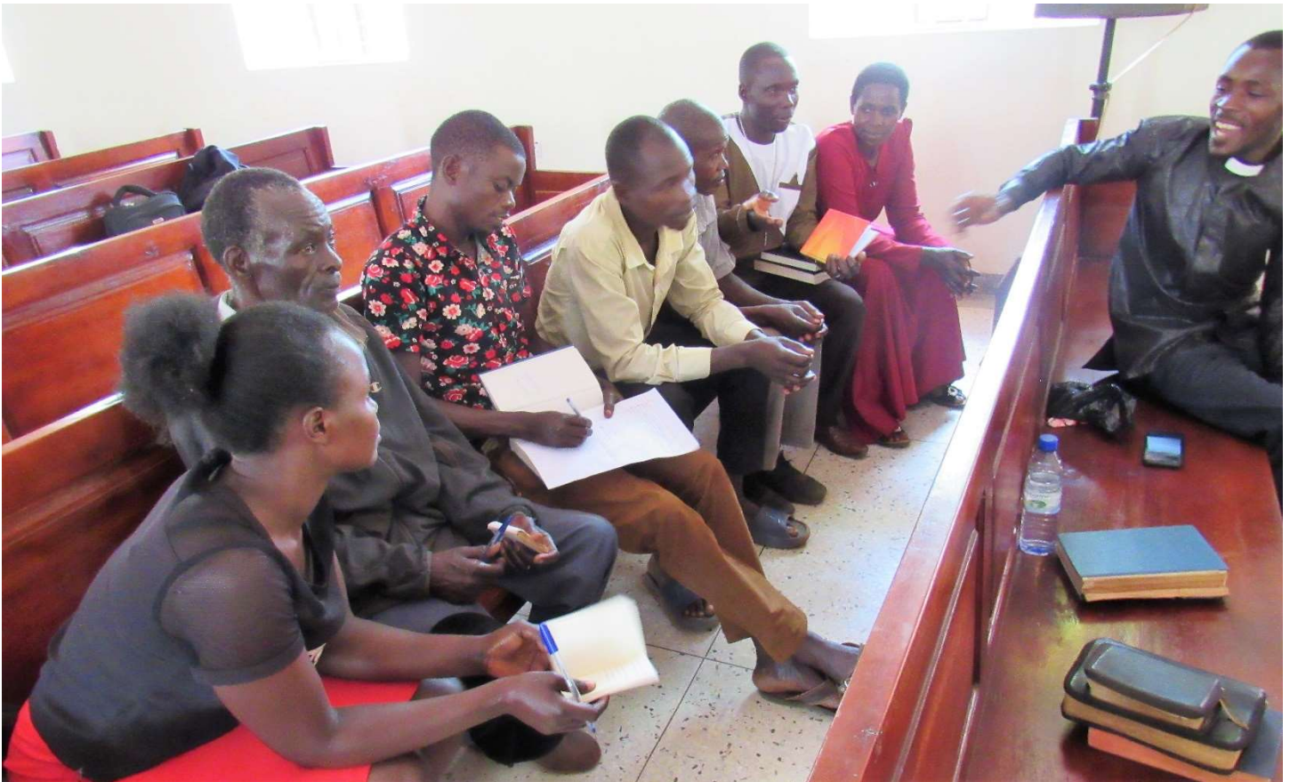
Small group discussion