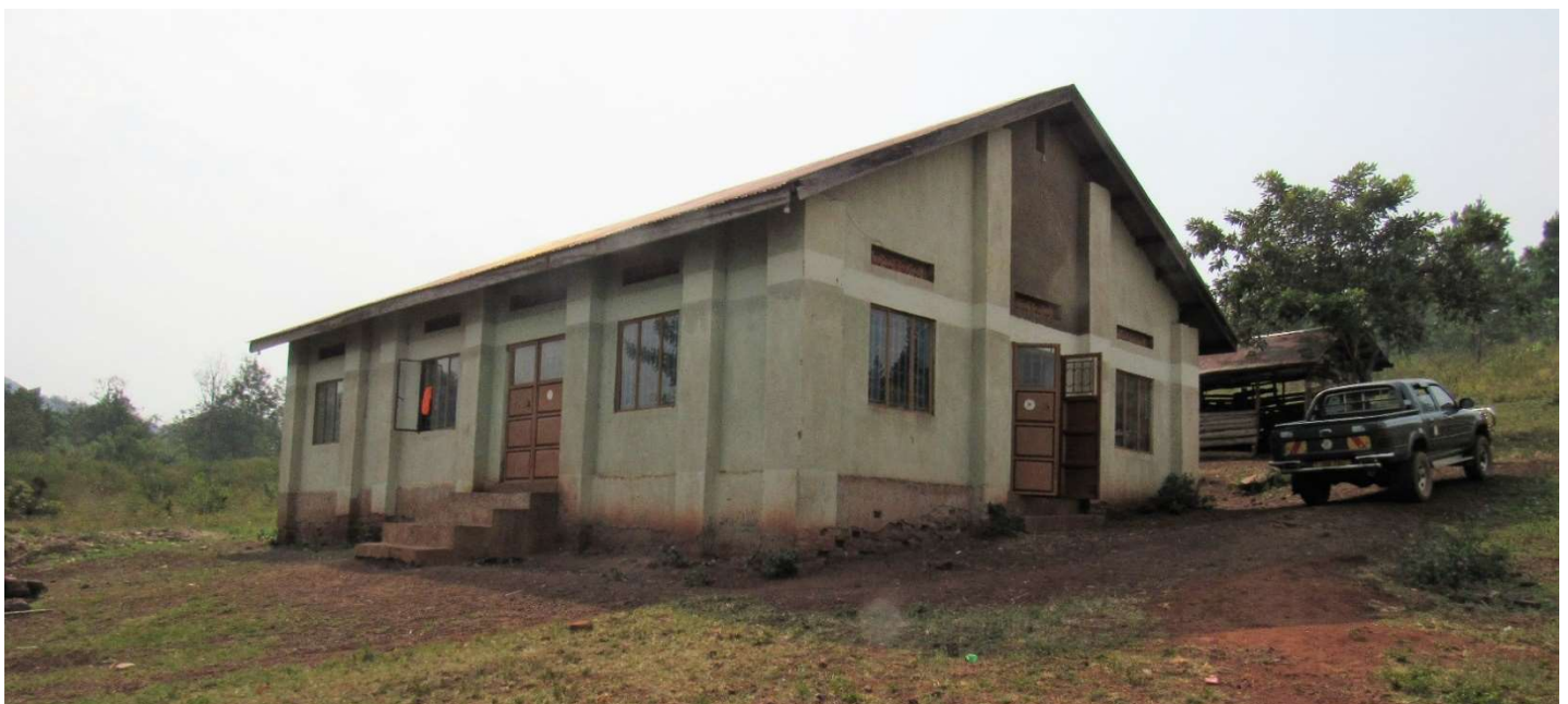
St. Peter's Lutheran Church and Primary School, Kyamujwara

We received a tour of the church and school, as well as the property owned by the church. Currently the school offers nursery school through 4 th grade, with the 3 rd and 4 th grade classes sharing the same room. There are not enough rooms to offer more classes. We also found out that the well pump on the property is broken and children have not had any water to drink while at school. A company came out on Friday to give an estimate for repairs and said it will cost roughly US$500, funds which neither the school, nor the deanery, now has.