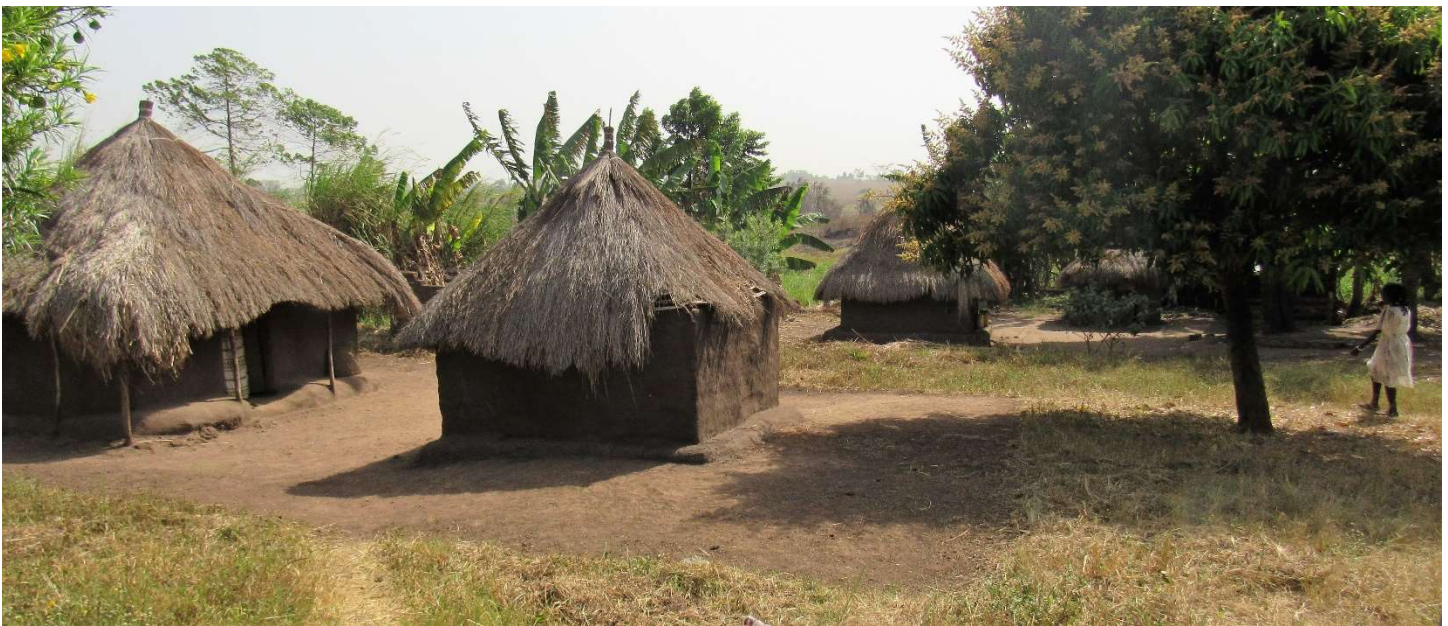
Housing for the school staff