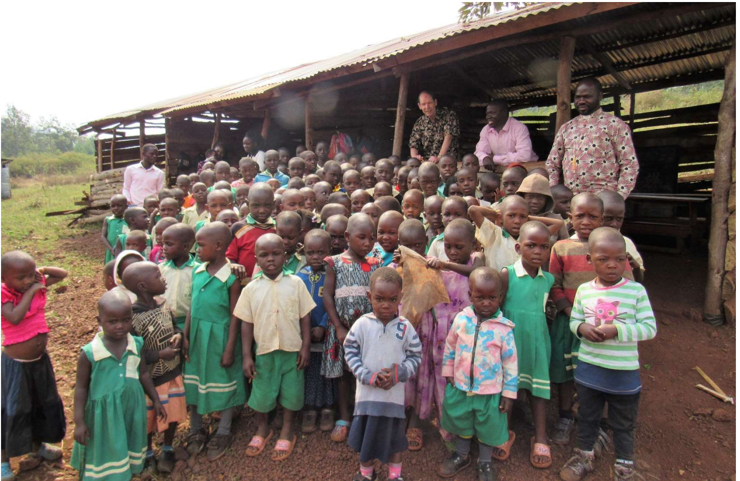
The visitors with the children, some of the classrooms are behind us