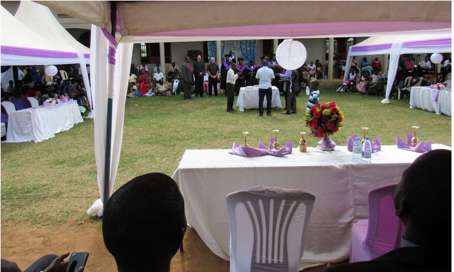
Cutting of the cake on graduation day