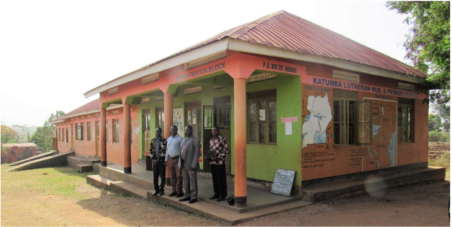
One of two classroom buildings