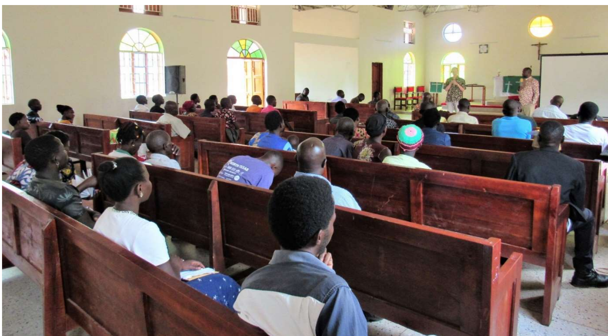
Day one of the Renewal Conference