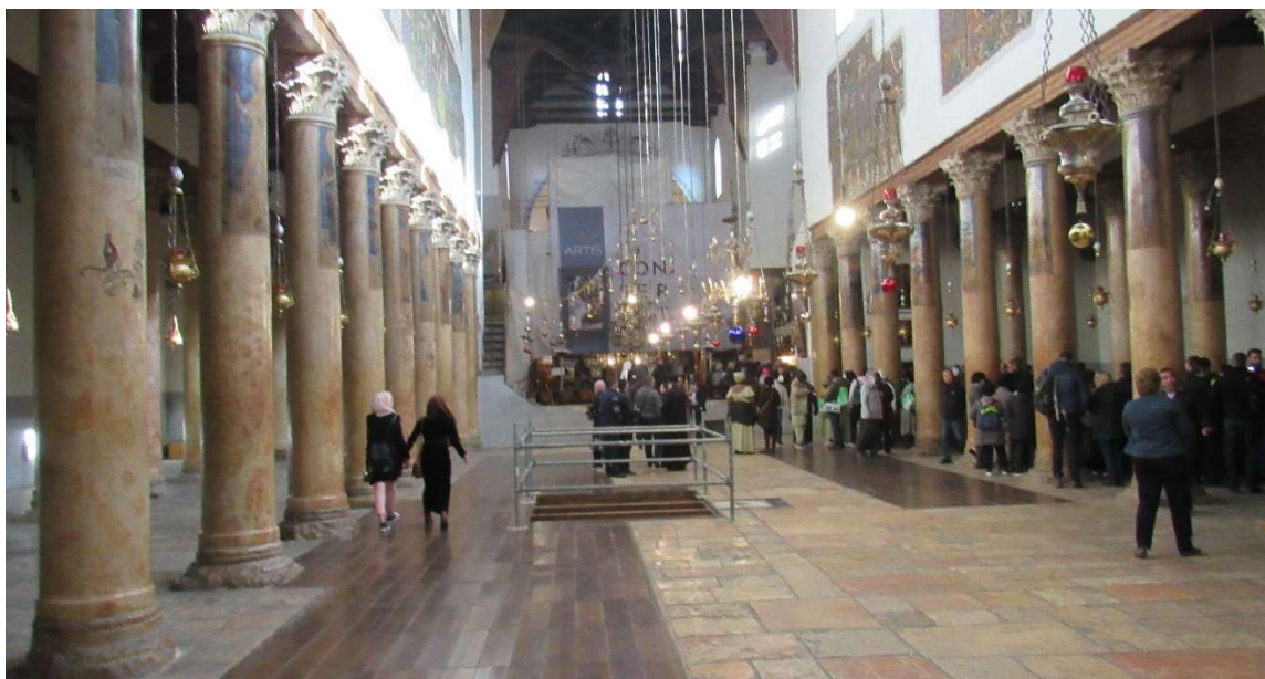
Church of the Nativity, Bethlehem, built in the mid-6 th century, traditional site of the birthplace of Jesus

Our 2021 Israel tour has been scheduled for January 11-20 and we are now accepting registrations. We have 52 exciting Old and New Testament sites on the tour that will greatly expand your knowledge of Christianity, Judaism, biblical history and archeology. Walk in the footsteps of Jesus in Nazareth, Jerusalem, the Mount of Olives, the Garden of Gethsemane, Bethlehem, Bethany, the Jordan, Capernaum, Magdala, Mt. Tabor (the Mount of Transfiguration), the Mount of Beatitudes, Caesarea Philippi, and enjoy a boat ride on the Sea of Galilee. We'll also visit Masada, Qumran, where the Dead Sea scrolls were found, Herodian, Jericho, Caesarea Maritima and many other historic sites. A tour of Israel truly is an experience you will treasure for the rest of your life. Tour arrangements are being handled by Imagine Tours and Travel, a company that has led hundreds of tours to Israel for over 30 years. Call or e-mail our office for a brochure and registration form, which we can send you either by mail or e-mail.