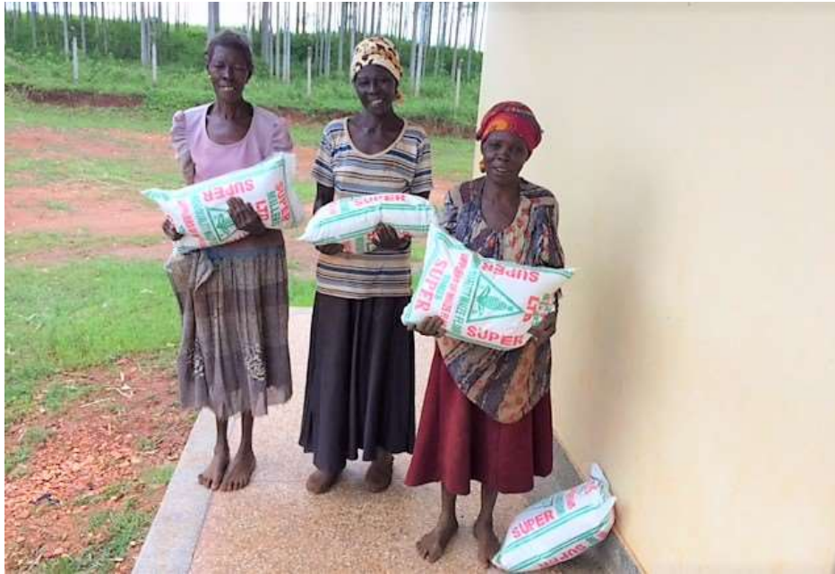
Members of Our Savior Lutheran Church, Magamaga receiving food supplies

“Like” us on Facebook - Lutheran Lay Renewal of America